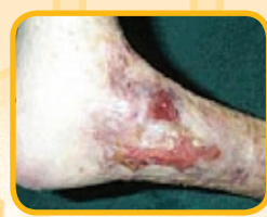
After 10 weeks with treatment with honey.

Active Jarrah is recognised by a symbol that includes a number that determines its antimicrobial strength.