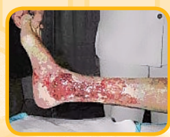
Before treatment with honey.