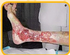
Before treatment with honey.